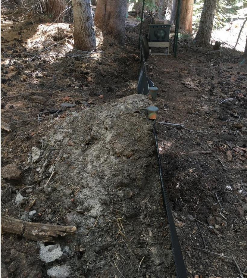
Figure 14: An earthen ramp jump-out for amphibians. California.