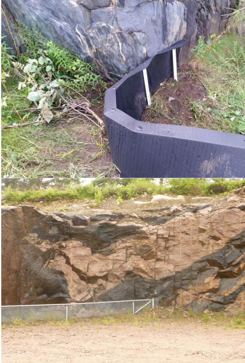
Figure 2: Examples of small animal fence-end tied into steep rocks (fence is about 2 feet [60 centimeters] tall). A small animal following the fence would not be able to travel around the fence-end and would likely travel back from where it came.

high levels of human presence and disturbance are good examples of where one may choose to have a fence-end (Figure 2). The fence may also simply extend beyond a habitat that may be associated with the target species; this is also expected to reduce the probability of a fence-end breach.