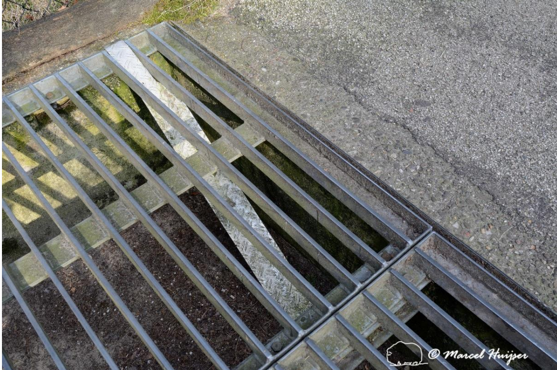
Figure 5: A wildlife guard at an access road in line with a fence designed for large mammals. Note that this wildlife guard has an escape ramp from the pit for small animal species. The Netherlands.