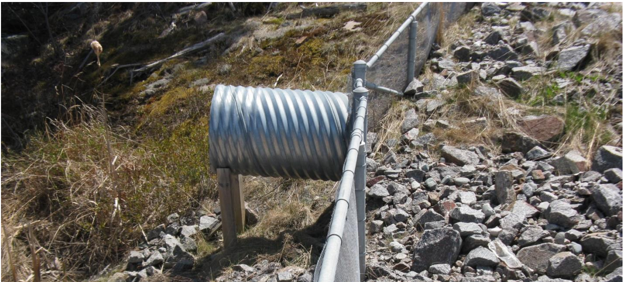
Figure 15: A jump-out made from corrugated steel pipe for small animal species (specifically turtles) used along a highway in Ontario, Canada. The pipe is raised on the safe side so animals cannot access it. On the road-side, the pipe is level with the ground.