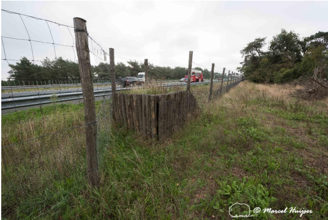
Figure 12: Jump-out for medium-sized and large mammals along an 8-foot (2.4-meter) tall wildlife fence. The Netherlands.