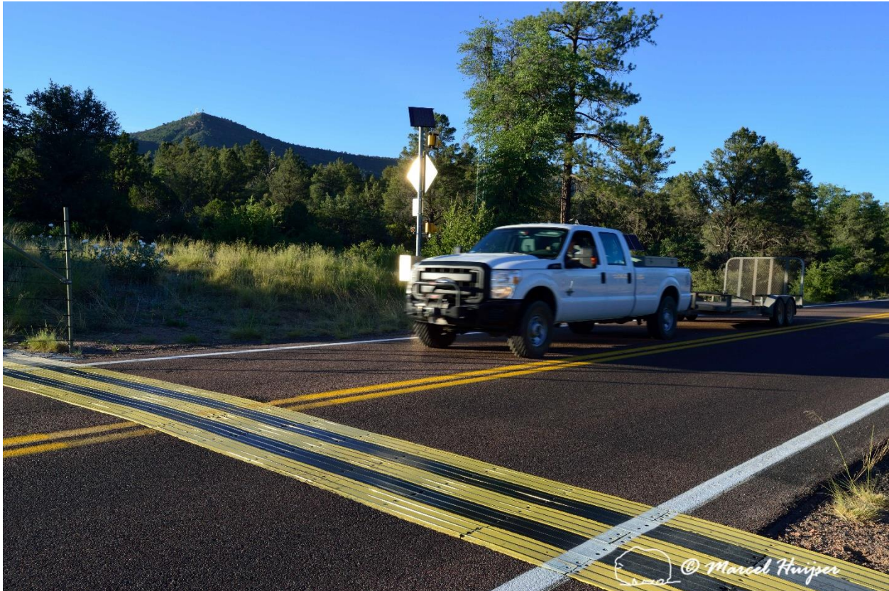
Figure 4: Electric mat at a fence-end and a large mammal electric fence angled towards the paved road surface. While these measures were mainly designed for large mammals, this design principle may also have application for small animal species, mainly small felids, canids, and other medium-sized mammal species with “paws.” Note that the electricity may result in problems for amphibians and reptiles. Also note that “double-wide wildlife guards” are more effective in keeping ungulates from the fenced road corridor. For more information on research of this electric mat, see Gagnon et al. (2010). USA.