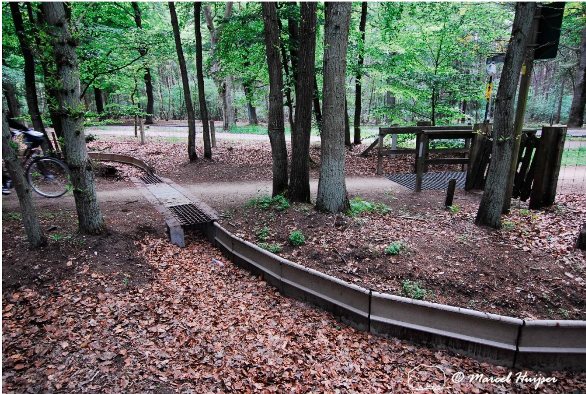
Figure 9: A wildlife guard at a bicycle path to keep amphibians, mostly common toad ( Bufo bufo ), from the road corridor (visible in the background). The Netherlands.