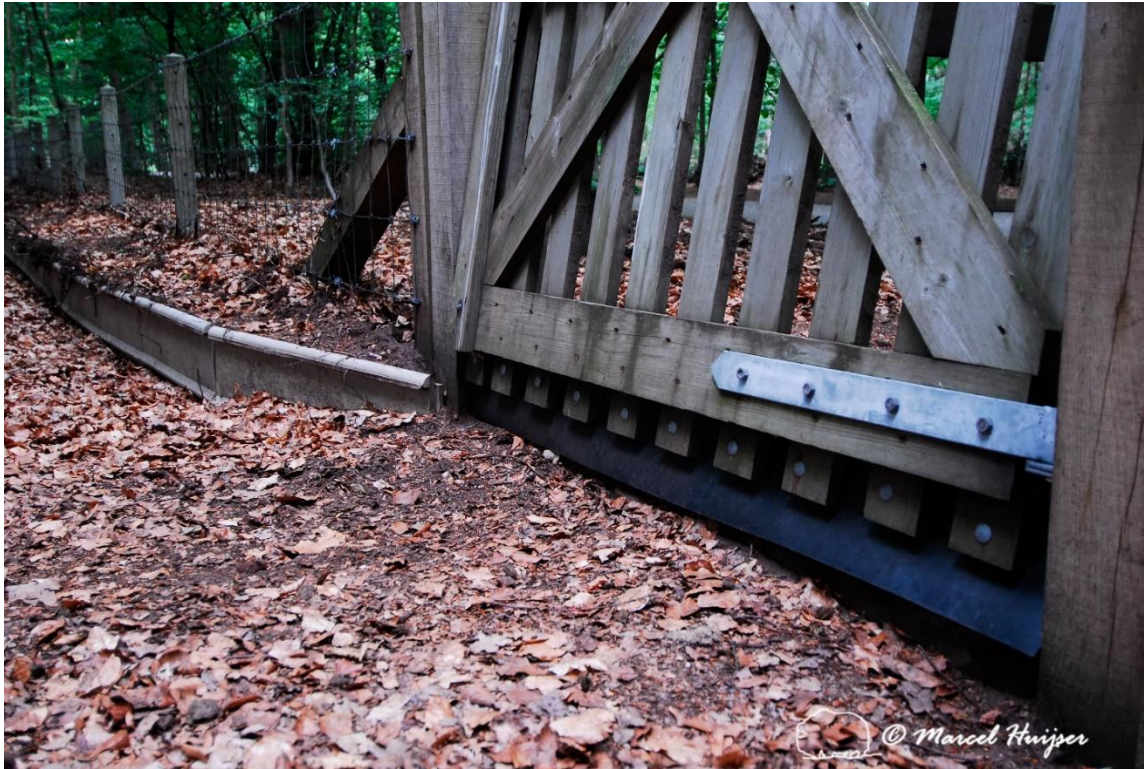
Figure 8: A pedestrian gate with a “flap” to keep amphibians, mostly common toad ( Bufo bufo ), from the road corridor. The Netherlands.