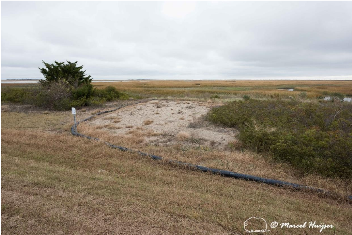
Figure 7: While this plastic corrugated pipe was not an effective barrier for northern diamondback terrapins ( Malaclemys terrapin terrapin ), the fence-end is angled away from the road at a considerable distance, encouraging turtles to turn back rather than cross at-grade at the end of the barrier. For more detail on this barrier, see Huijser et al. 2019).