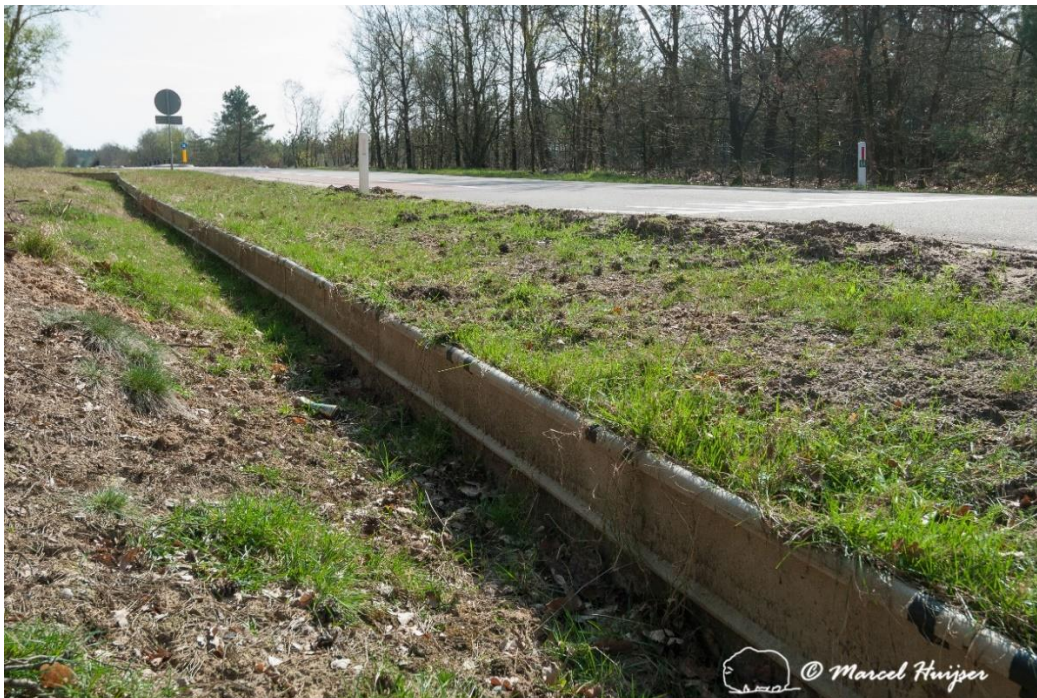
Figure 17: A barrier wall for amphibians, specifically common toad ( Bufo bufo ). Animals that end up on the road between the barriers can jump back or fall back to the safe side at any point along the barrier section of road. The Netherlands.