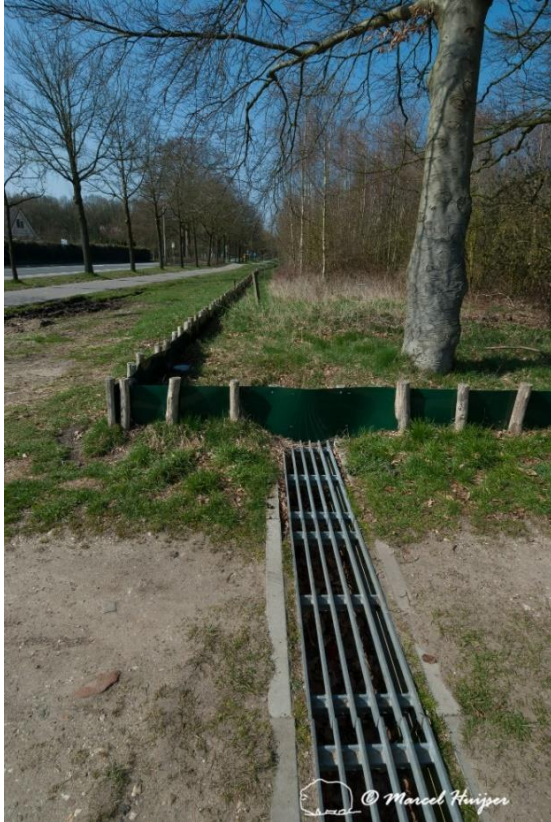
Figure 10: A wildlife guard at a low volume dirt access road to keep amphibians, mostly common toad ( Bufo bufo ), from the road corridor (visible to the left). The Netherlands.