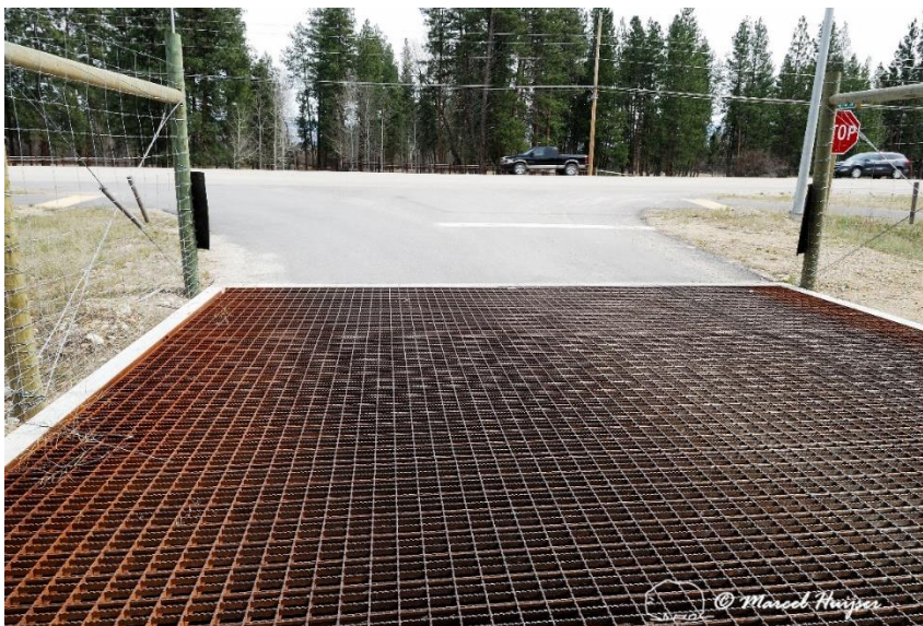
Figure 11: A wildlife guard at an access road in line with a fence designed for large mammals. Note that this wildlife guard has solid concrete edges associated with the pit. These ledges can be used by medium- and large-sized mammals to access the fenced road corridor. Therefore, these ledges should not be accessible at all anywhere. The situation in the image above has not been retrofitted yet; the concrete ledge is still accessible, despite the presence of the rubber flaps (aimed at large ungulates but likely ineffective from keeping them from using the concrete ledge). For more details on this wildlife guard design, see Allen et al. (2013). USA.