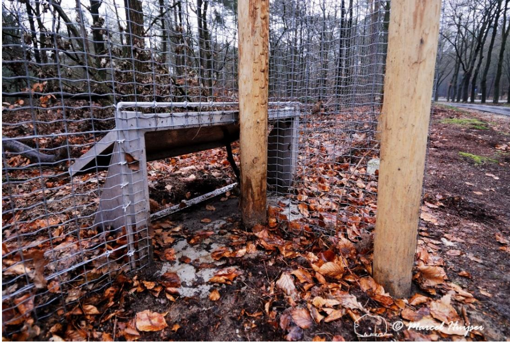
Figure 16: A one-way gate for Eurasian badgers ( Meles meles ). Note that the gate is temporarily propped open with a stick for the image to show that it opens when pushed from the roadside of the fence. The gate is positioned on a concrete footing. Ideally this footing should be cleared from debris on a regular basis to prevent the gate from not closing after use. The Netherlands.