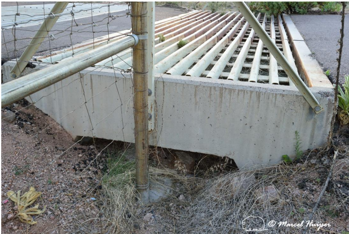
Figure 6: A wildlife guard at an access road in line with a fence designed for large mammals. Note that this wildlife guard design allows small animal species to escape towards the sides. Note that “double-wide wildlife guards” are more effective in keeping ungulates from the fenced road corridor. USA.