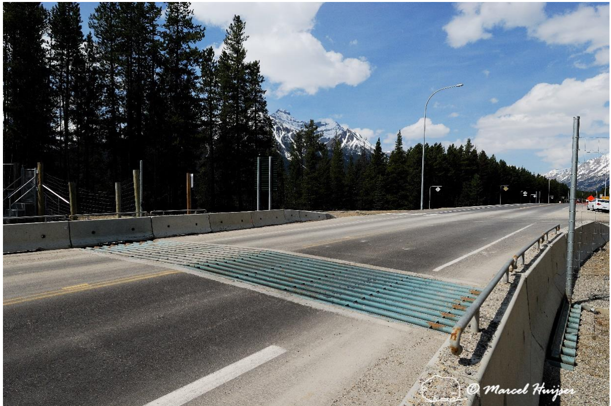
Figure 3: Large mammal fence angled towards the paved road surface and a wildlife guard at a fence-end. While these measures were mainly designed for large mammals, this design principle may also have application for small animal species. Note that small animal species may require escape opportunities from the “pit.” Also note that “double-wide wildlife guards” are more effective in keeping ungulates from the fenced road corridor. Canada.