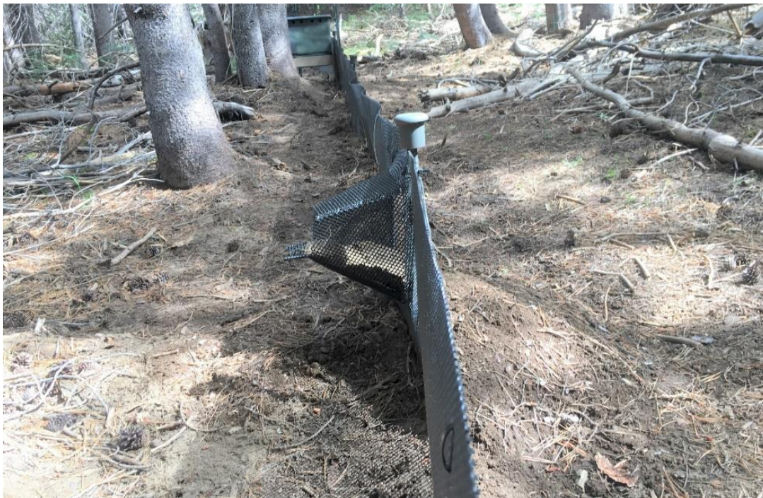
Figure 13: Jump-out for amphibians. The “cone” structure reduces the height of the jump-out. The cone-shape reduces the likelihood that animals will enter through the opening because they are expected to move along right next to the barrier rather than a bit farther back below the opening. California. Designed by ERTEC for a U.S. Geological Survey project.